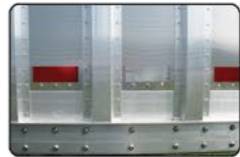
Extruded Aluminum Lower Rail