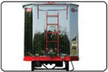
Optional Secondary Landing Gear