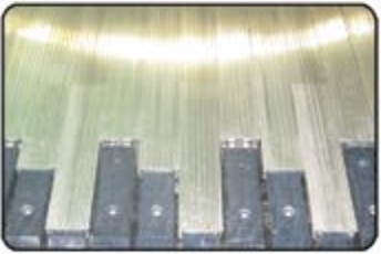
18" Diagonal Front Design