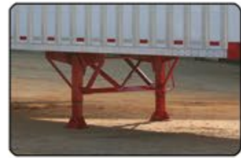
Heavy Duty 2-Speed Landing Gear