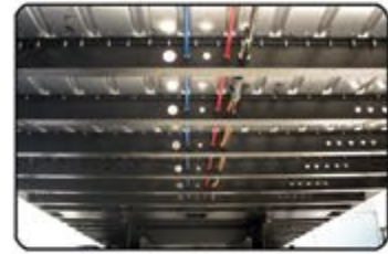
Wax Coated Floor Sills