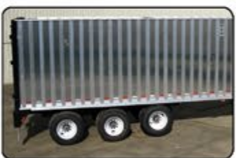
Multiple Axle Configurations