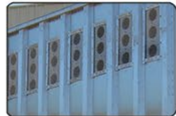
Aluminum Vent Covers